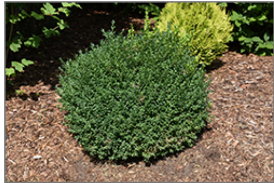
North Star Boxwood