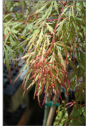
Spring Delight Japanese Maple foliage