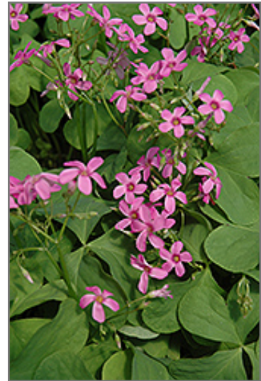
Pink Wood Sorrel flowers