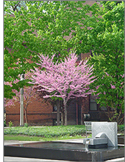
Eastern Redbud (tree form) in bloom

Eastern Redbud (tree form) is recommended for the following landscape applications;