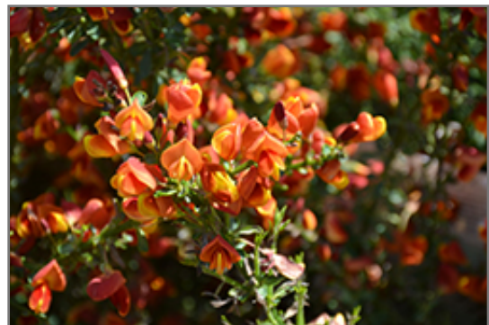
Lena Scotch Broom flowers