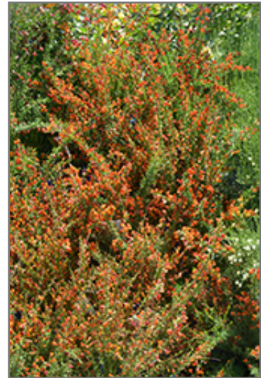
Lena Scotch Broom in bloom

This shrub should only be grown in full sunlight. It prefers dry to average moisture levels with very well-drained soil, and will often die in standing water. It is considered to be drought-tolerant, and thus makes an ideal choice for xeriscaping or the moisture-conserving landscape. It is particular about its soil conditions, with a strong preference for clay, alkaline soils, and is able to handle environmental salt. It is highly tolerant of urban pollution and will even thrive in inner city environments. This particular variety is an interspecific hybrid.